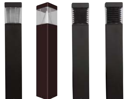
DuraLED Square Bollards*