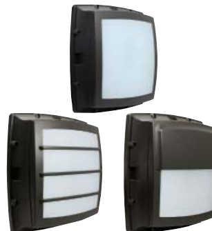
DuraLED Square Orah Series*