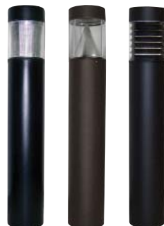
DuraLED Flat Top Bollards*