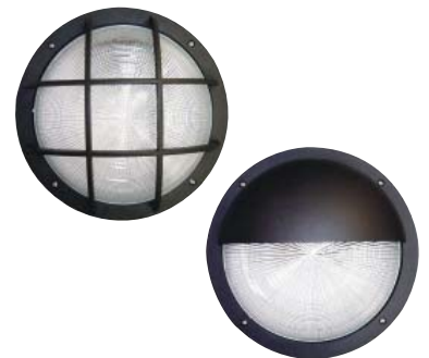
DuraLED Ovation Series

Specifications subject to change without notice.