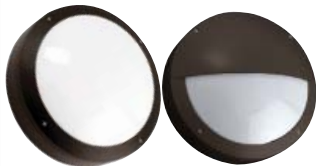
DuraLED Dart Round Bulkhead