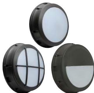
DuraLED Round Orah Series*