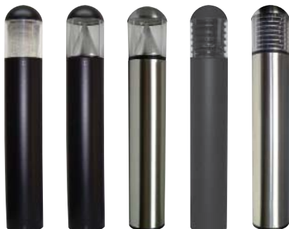
DuraLED Dome Bollards*