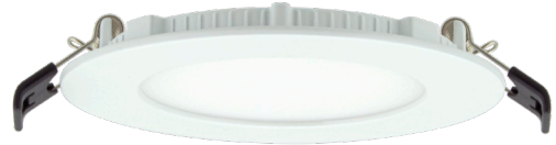
4" BRIO RGB+TW