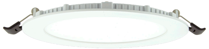
6" BRIO RGB+TW