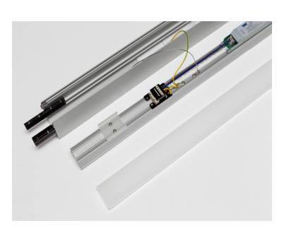
Three-part system allows for easy wiring with prewired harnesses and allows for custom finishes on channedl