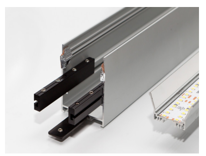
Joins easily with a mechanical spline