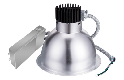
CRLX10-50-80W-MP Complete Unit