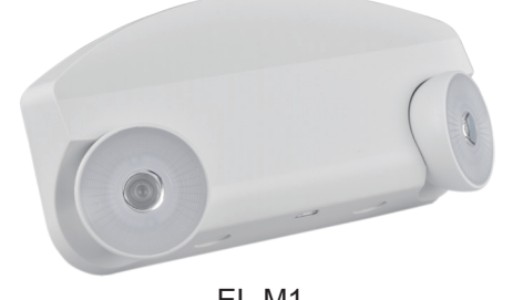
EL-M1 LED Mini Emergency Light