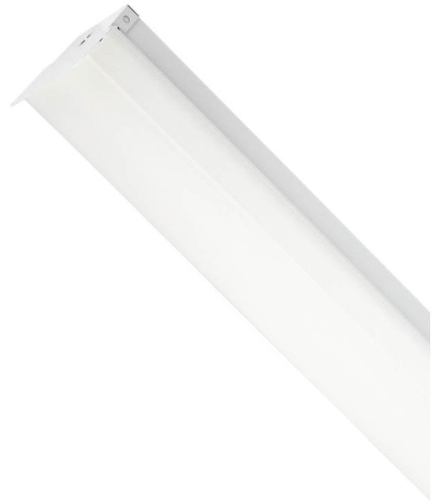
2-FT and 4-FT Models