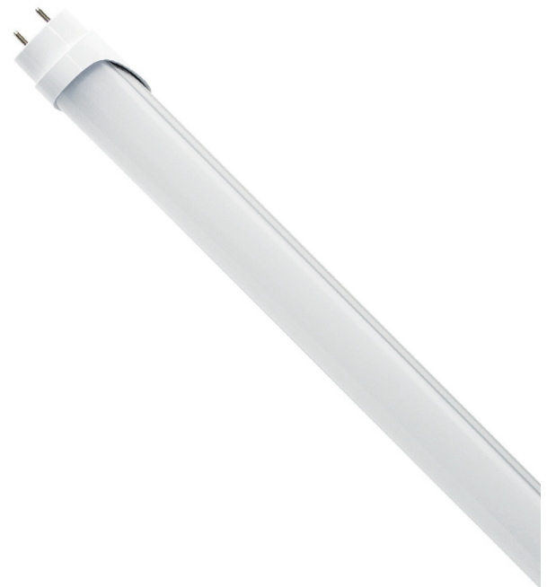
5X-CCT and 3X-Wattage Tuning Switches