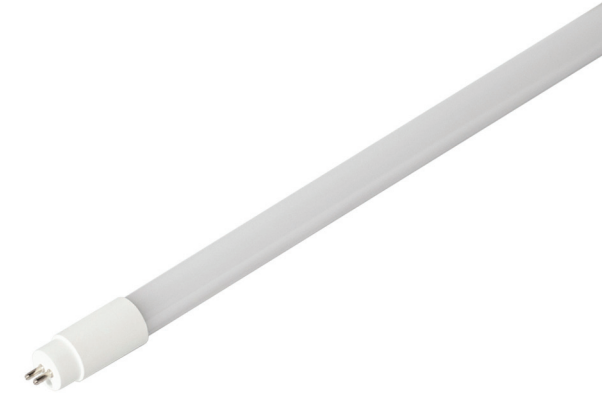
4-FT T5 Models