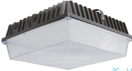
3C - 4C