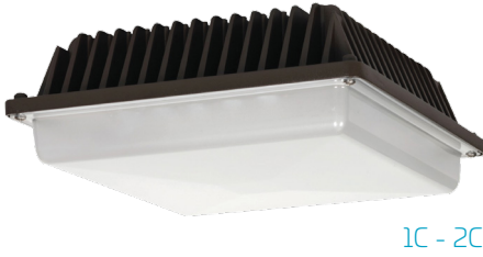
1C - 2C