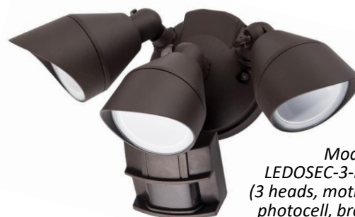
Model LEDOSEC-3-PCMS-BRZ (3 heads, motion sensor & photocell, bronze finish)

** L_{70} hours are IES TM-21-11 calculated hours.