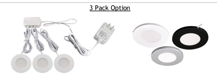
Included: 3 Pucks with WH, BK & BN Trims, Cables and 6 Port Hub Plug-in Driver 120VAC 12W Non Dimmable