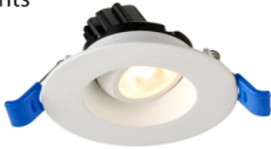
Type IC, Wet & Air-Tight