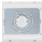
Surface Mount Bracket Included