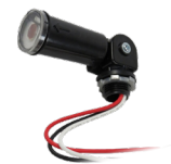
PSA Adjustable Photocell