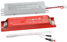
EM LED Emergency Driver