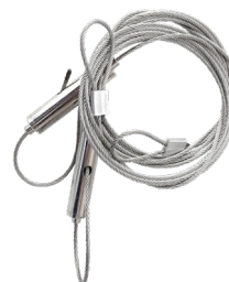
A-CBL 8' Aircraft Cable, V-Hook included