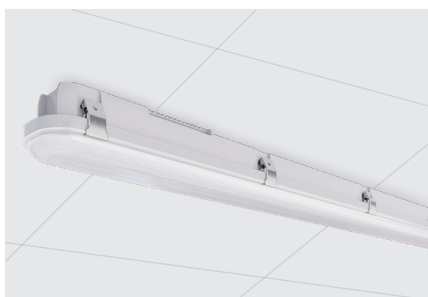
SM Surface mount