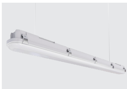
V-HOOK Suspended Mount