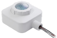
MS Motion Sensor