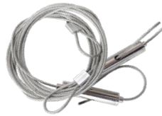
A-CBL Hanging wire for strip light w/ V-hook