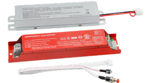
EM LED Emergency Driver