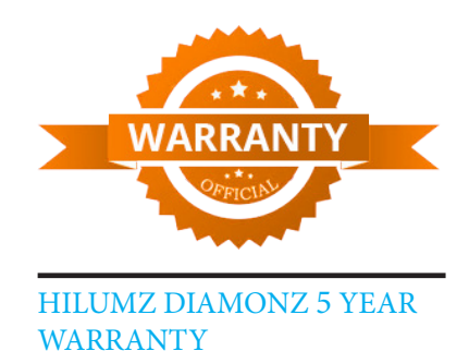
5-year warranty on components and on the LED Driver. See full warranty on website HiLumzUSA.com

Solar Occupancy Sensor Switches - No Wires & Batteries AJ-DIM-OA-SUN