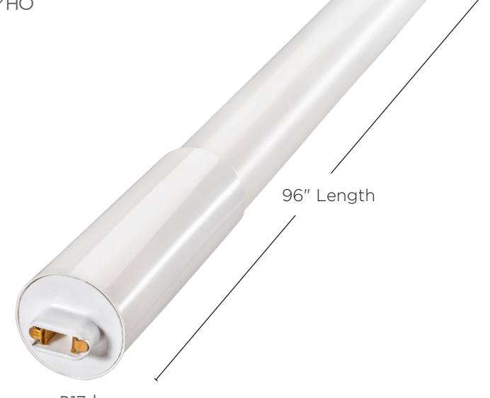
R17d (Recessed Double Contact Base)