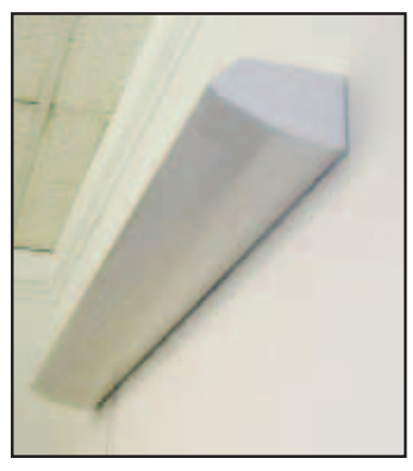
Mounted on Wall

* Companion to the LIN series pendant mount indirect