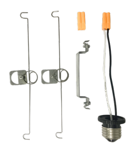
Recessed Mounting Kit included