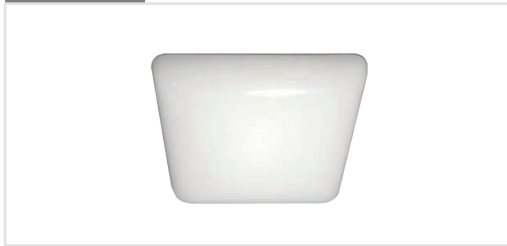
[ CMED 111(4) ]